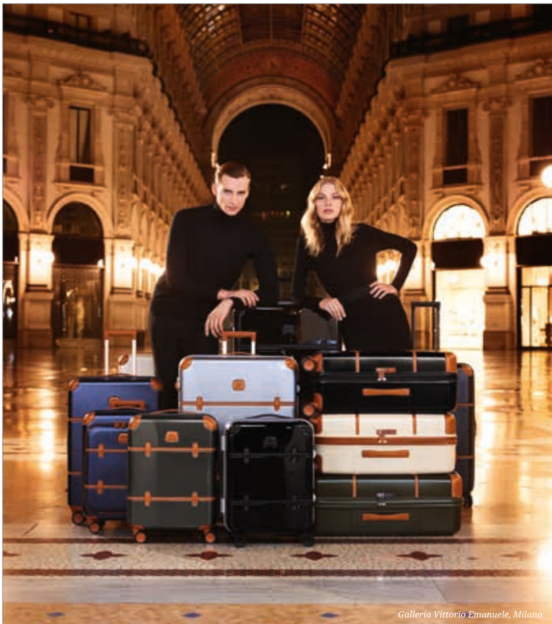
Galleria Vittorio Emanuele, Milano