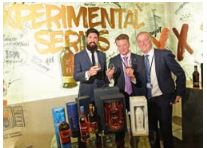
Golden Village G02

family brewer in Speyside to help create an IPA that could lend some hoppy character to casks before they were filled with the whisky. Alongside the new expressions from Glenfiddich, William Grant & Sons also introduced a new expression for its Irish whiskey brand Tullamore D.E.W. named XO Rum Cask.