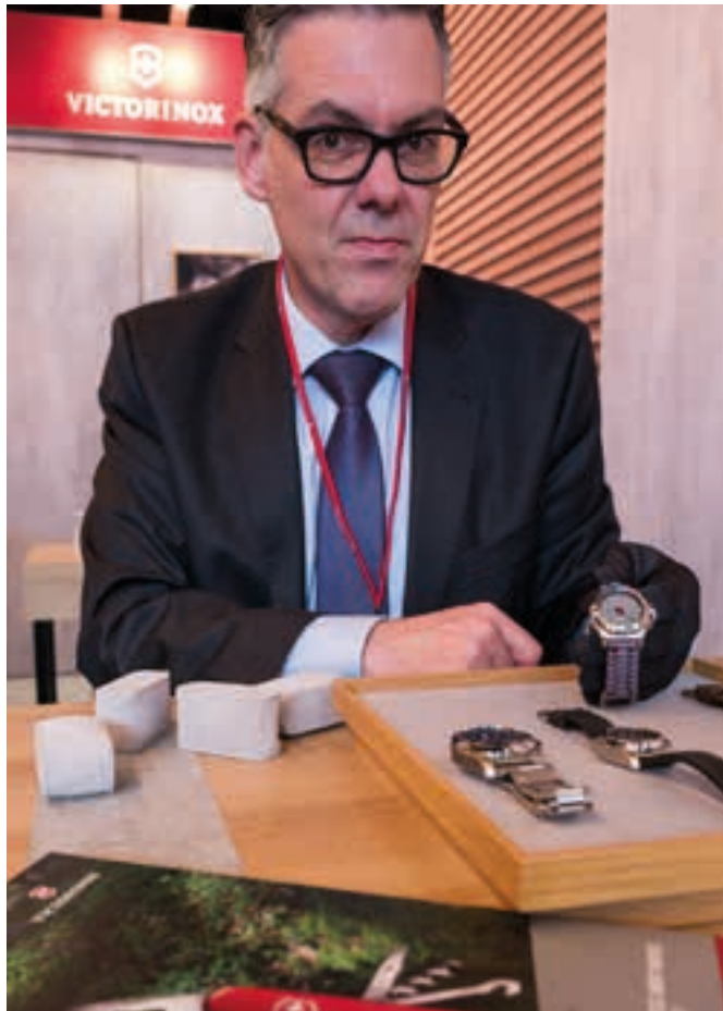
Bay Village Bay 17B