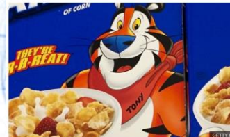
Cartoon or fictional characters, like Tony the Tiger and the Milky Bar Kid, should no longer be used to promote unhealthy food, a group of MPs says.