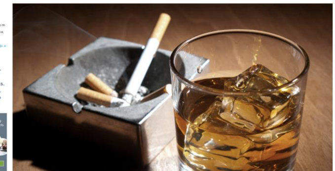
SEN TAX: Legislators want to increase the taxes imposed on tobacco and alcoholic drinks