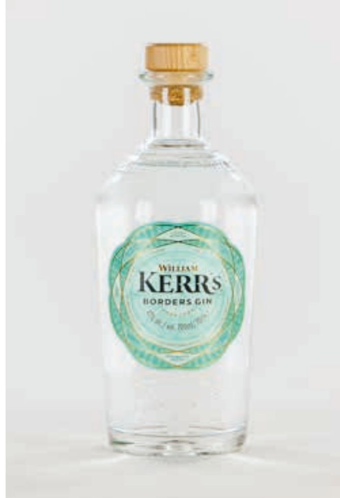
▲ William Kerr's is a gin where you can really taste the 'Barley to Bottle' difference versus London Dry gins. It is for the discerning gin drinker looking for something with real provenance and taste.