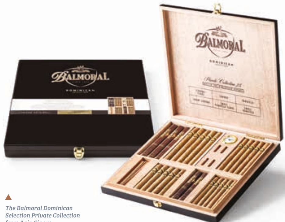
The Balmoral Dominican Selection Private Collection from Agio Cigars.