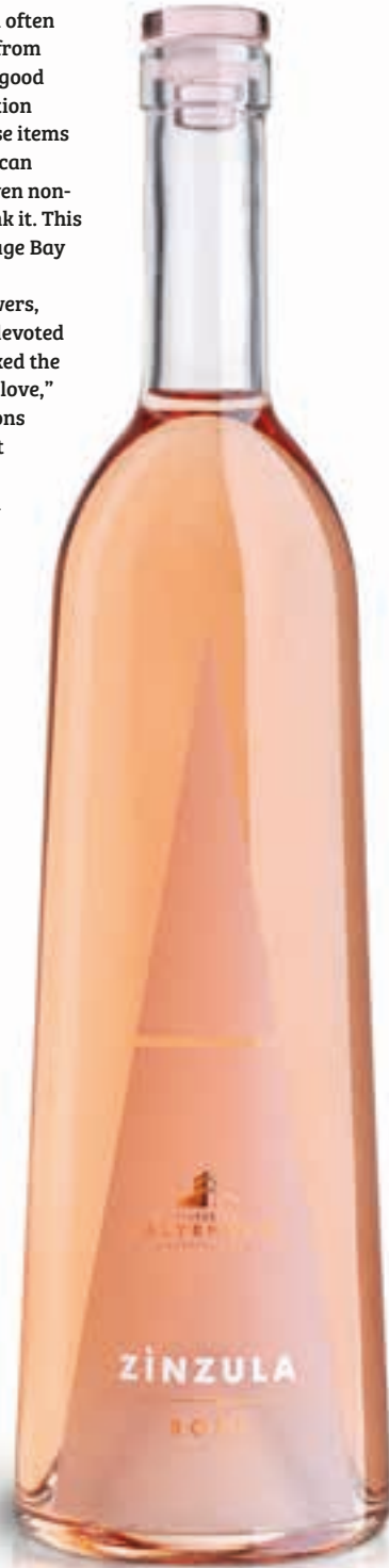
▲ Among the new products Zonin 1821 (Blue Village C5) is showcasing at TFWA World Exhibition & Conference is Zinzula - Masseria Altemura. The rosé is made with Negroamaro grapes.