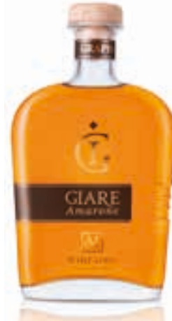
◀ Marzadro is showcasing its Grappa Le Giare Amarone that, in 2018, won the Pomace Brandy Trophy at the International Wine and Spirit Competition.