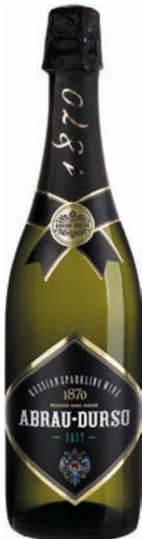
▲ At TFWA World Exhibition & Conference, Russian Wine House Abrau-Durso is featuring sparkling and still wines including Cuvée Alexander II (Brut Rosé, Brut), Victor Dravigny (Brut, Demi-Sec, Semi-Sweet, Rouge), Brut D'or Blanc de Blanc, Russian Sparkling Wine, and Chateau d'Avize, among others.

Champagne Lanson is returning to TFWA World Exhibition & Conference after a short absence. It is using the event to introduce its new Organic Champagne, Lanson Green Label, and exclusively preview its new brand platform that will be officially launching in 2020.