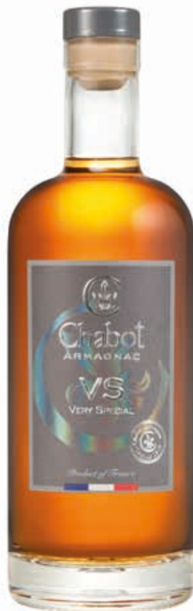
Chabot Armagnac's main focus is the Chabot VS – or 'Very Special'. The Chabot VS is warm and balanced, with a taste of fresh fruits and notes of plum and apple on the nose.