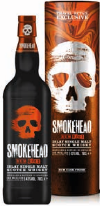
▲ Ian Macleod Distillers’ brands appeal to independently-minded older millennial whisky and dark spirits drinkers who collect and curate brands, tastes and experiences they value.