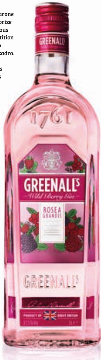
Quintessential Brands is showcasing Greenall's Citrus Grandis, as well as the new Greenall's Rosea Grandis – a distinct wild berry, pink gin that is also sugar-free.

“Plomari Ouzo Distillery is located in Plomari, Lesvos, where the ingredients for the distillation of Ouzo Plomari are found,” says Trivizas. “The main ingredient, anise, comes from the distillery’s privately-owned