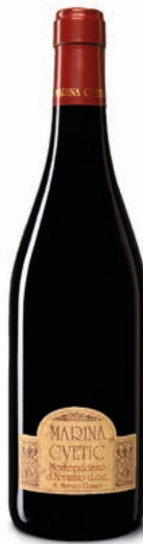
▲ Consisting of six references, the Marina Cvetic line from Masciarelli Winery is characterised by the presence of international grapes in purity (Merlot, Cabernet Sauvignon, Syrah and Chardonnay) beside Montepulciano and Trebbiano.