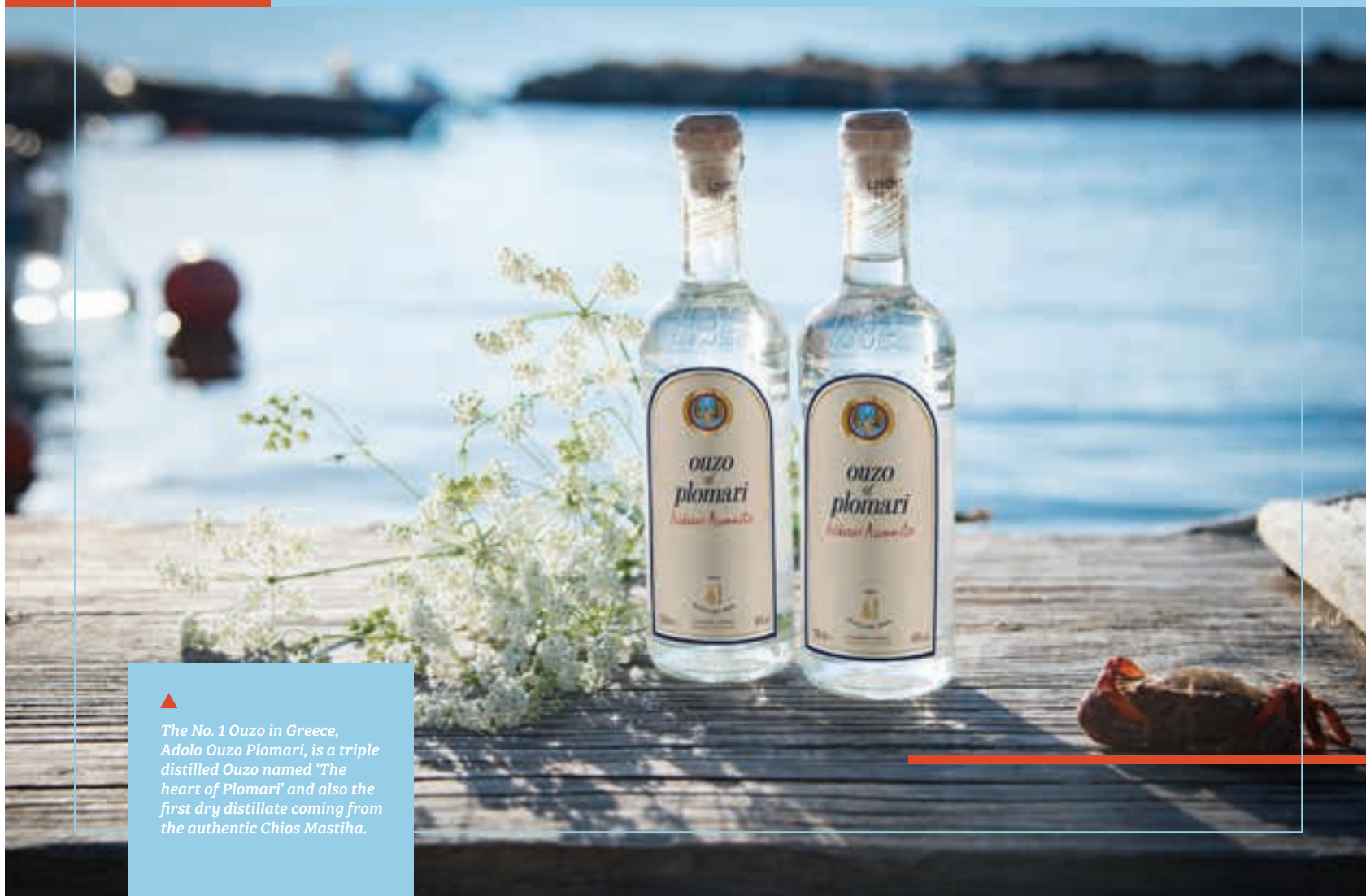
▲ The No. 1 Ouzo in Greece, Adolo Ouzo Plomari, is a triple distilled Ouzo named “The heart of Plomari” and also the first dry distillate coming from the authentic Chios Mastiha.

Tapping into the consumer psyche can help unlock sales. Considering what is important to people, whether that be making or preserving memories or transmitting meaning in some way can all help to