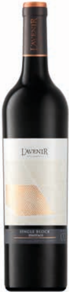
▲ AdVini wines are individual in their character, yet united in their winemaking vision, rich heritage and esteemed reputation.