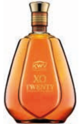
▶ KWV is unveiling four of its globally award-winning KWV brandies, including the KWV 20 Year XO Potstill Brandy, KWV 15 Year Alambic Postill Brandy, KWV 12 Year Small Batch Potstill Brandy, as well as the KWV 10 Year Barrel Select Postill Brandy.

JOIN US AT TFWA WORLD’S EXHIBITION & CONFERENCE 2019 IN CANNES BAY 19, BAY VILLAGE