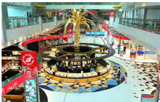
Dubai Duty Free achieved an all-time sales record of US$2.16 billion in 2023 and is positive that sales in 2024 will meet the target by year-end of US$2.19 billion.

Dubai Duty Free continues to enhance its retail operation and is refurbishing its three main Arrivals shops in Terminals 1, 2 and 3. "The construction work in Terminal 3 Arrivals already started in April, while for Terminal 1 and 2 Arrivals, site construction work is expected to commence this May," McLoughlin explains. "With these, we are expecting to have newly refurbished Arrivals shops in these three terminals by the end of the fourth quarter with a total retail