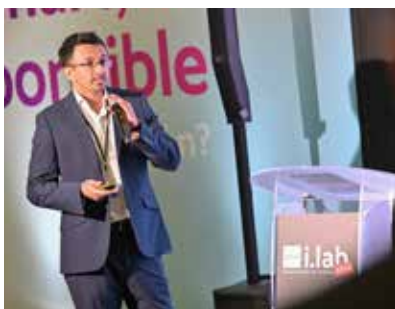
Virtual Wander is dedicated to redefining the retail and exhibition experience using cutting-edge 3D technology, seamlessly integrating the digital and physical realms to engage consumers and enhance brand interactions.

The primary goal of Virtual Wander in TFWA i.lab Asia is to showcase its potential as a valuable concept for brands and stakeholders within the travel retail sector. “By presenting Virtual Wander as a viable solution, we aim to illustrate how its implementation can significantly enhance customer experiences across various touchpoints,” Rased added.